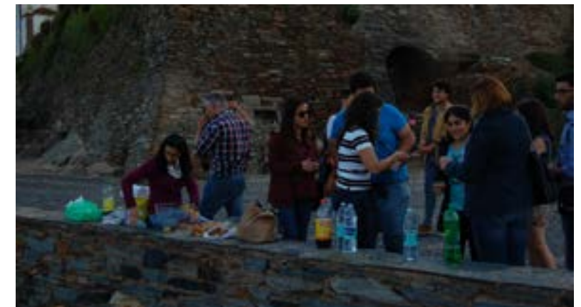
Snack for ERASMUS+ family