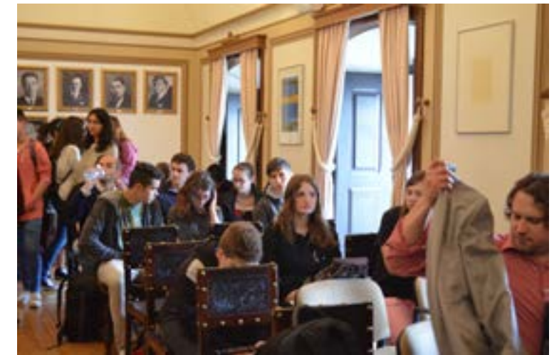
Meeting at Vidigueira Municipality