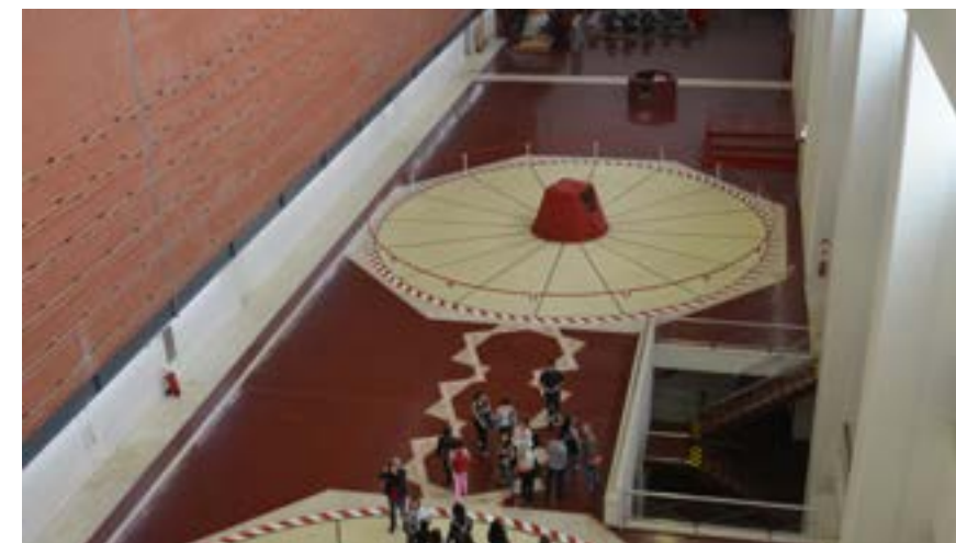
Visiting EDIA - water supply company