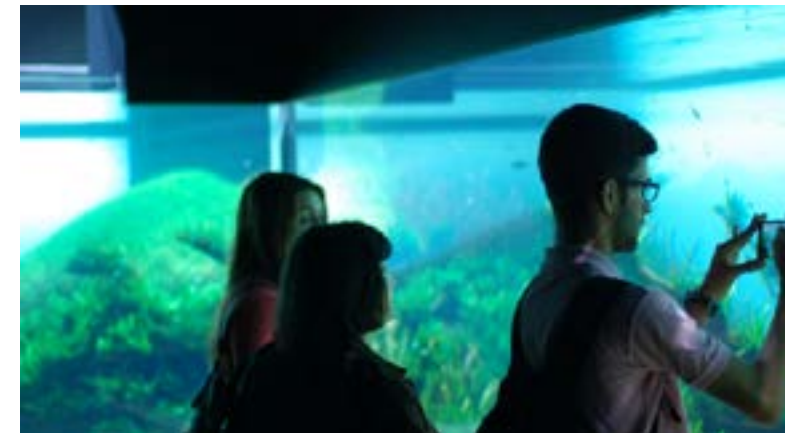
Italian group during visiting a Oceário in Lisbon

During our visits I watched the managers and how they behaved to their employees very carefully and I understand that the basic thing is that there must be a very good relationship between workers and entrepreneurs. You must be a person with very strong skills: you must be intelligent and know how to talk. Every little thing must be perfect if you want to be on top.